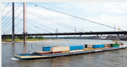
Combined road and water transport

No traffic congestion, significantly fewer emissions than road transport, optimum value for money: with short sea shipping, your goods travel economically with minimum environmental impact. Short sea shipping on just one ship replaces around 130 trucks. These departures are scheduled and can therefore be optimally integrated into our transport chains.