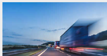
Pre-and on-carriage: everything remains in one hand