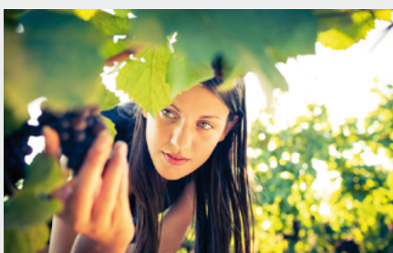
Transparency and documentation