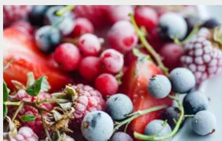
Temperature controlled shipments