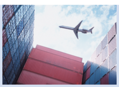
Sea and airfreight to meet your needs